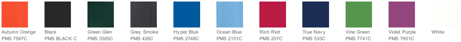
Autumn Orange PMS 7597C