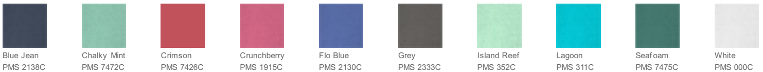
Blue Jean PMS 2138C